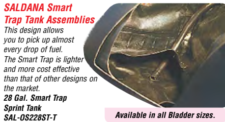
SALDANA Smart Trap Tank Assemblies This design allows you to pick up almost every drop of fuel. The Smart Trap is lighter and more cost effective than that of other designs on the market. 28 Gal. Smart Trap Sprint Tank SAL-OS228ST-T