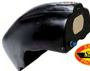
SALDANA Outlaw Tank Assemblies Supplied with -12 top pickup, and all accessories to complete the fuel cell assembly including: flush cap assembly, front cover plate and bladder. 25 Gal. Sprint Tank SAL-SB225 25 Gal. Sprint Tank - w/ Internal Baffle SAL-SB225-B 28 Gal. Sprint Tank SAL-SB228 28 Gal. Sprint Tank - w/ Internal Baffle SAL-SB228-B 33 Gal. Sprint Tank - w/ Internal Baffle SAL-OS234B-T