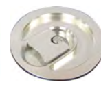
Flush Cap Alum. Flush Cap only. SAL-SAC-017