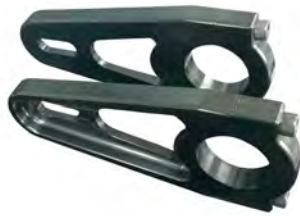
Adjustable Fuel Tank Clamp Bracket Kit XXX Sprint Car adjustable tail tank clamp set. Made from super strong aluminium with a black anodized finish. The clamps are CNC lightened to maximize strength and minimize weight. Clamps split in the middle to mount to the tail tank bar, and the bolt heads are recessed to conceal them and protect from debris. Adjustable clamps facilitate the mounting of any brand of fuel tank to the chassis. Sold complete with bolts. ID (for tank bar): 1.375" Colour: Black Anodized TXRC-SC-CH-7250

Full range of Schoenfeld Products available by special order.