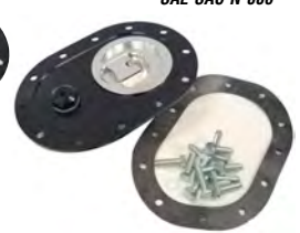
Top Plate Assembly Flush Cap, Plate, Rollover Valve, Bolts and Gasket. SAL-SAC-019