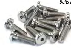
SPP Titanium Button Head Bolt Top Fuel Plate Kit (x12) SPPTFT-KIT