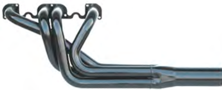
SCHOENFELD Straight Tube Sprintcar Headers Removes over 200 degrees of bend in comparison to standard headers, increasing flow and horsepower.