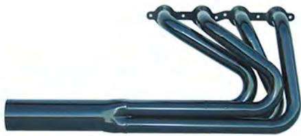
Schoenfeld Standard LS1 Port Sprint Headers (1-3/4"-1-7/8") SCH-1024LV-LS1