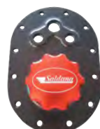
SALDANA Light Weight Top Plate Assembly The new light weight Saldana top plate assembly features a screw on cap with a built in rollover / vent valve and one -BAN and two -6AN ORB return ports to accommodate for simple plumbing. SAL-SAC-061