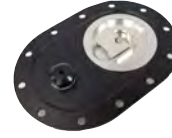
Cap, Plate, Valve Aluminium Flush Cap, Plate, & Rollover Valve. SAL-SAC-011