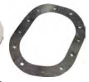
Gasket Top Plate Gasket. SAL-SAC-N-006