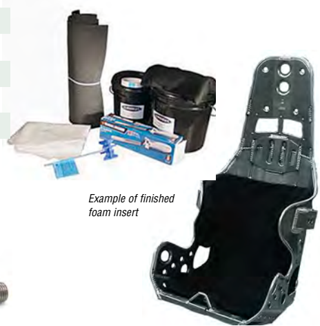
Example of finished foam insert